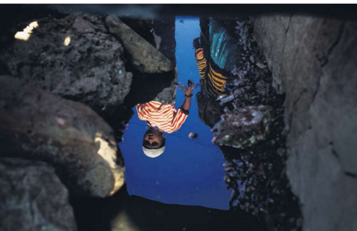
Children are reflected in suspected contaminated groundwater.