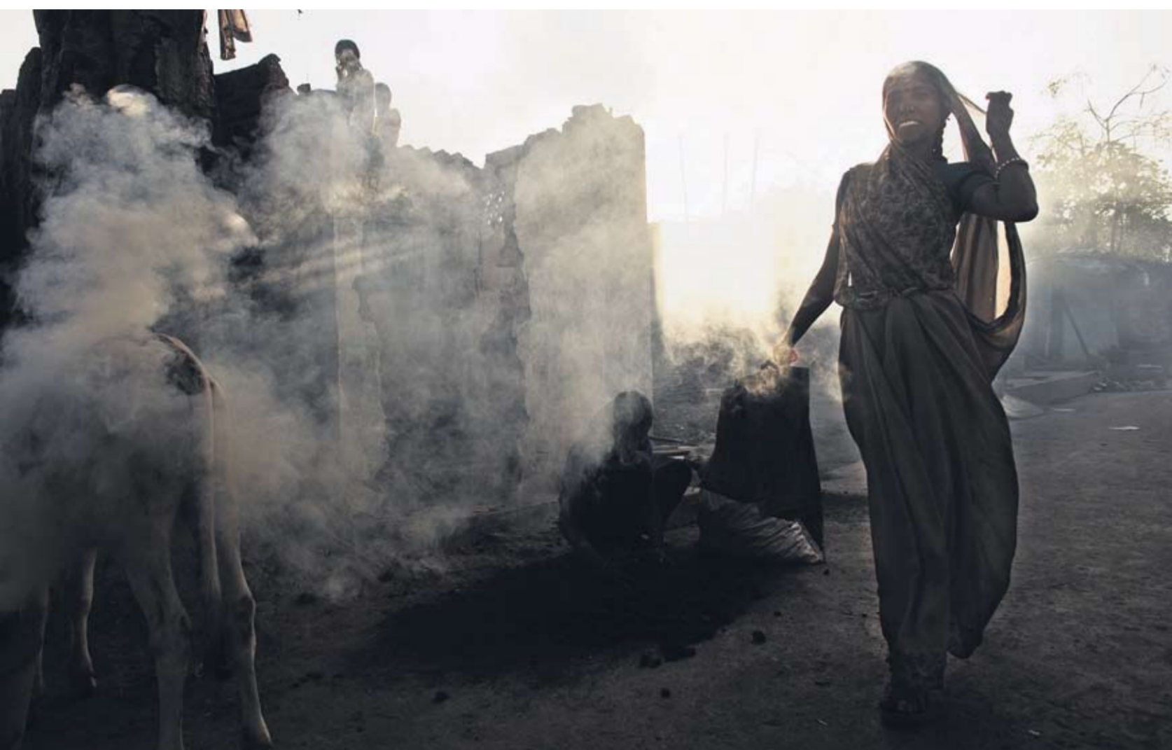
A woman burns fuel near the abandoned Union Carbide factory.