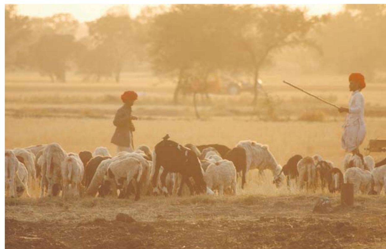
Nomadic tribesmen graze their cattle on the outskirts of Bhopal.